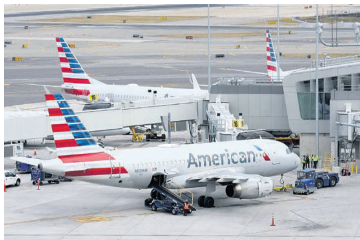
American Airlines planes sit on the tarmac at Terminal B at LaGuardia Airport, Jan. 11, 2023, in New York.